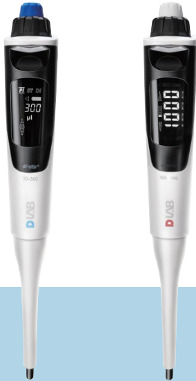
dPette+ For Pipetting, Mixing, Stepper and Dilution